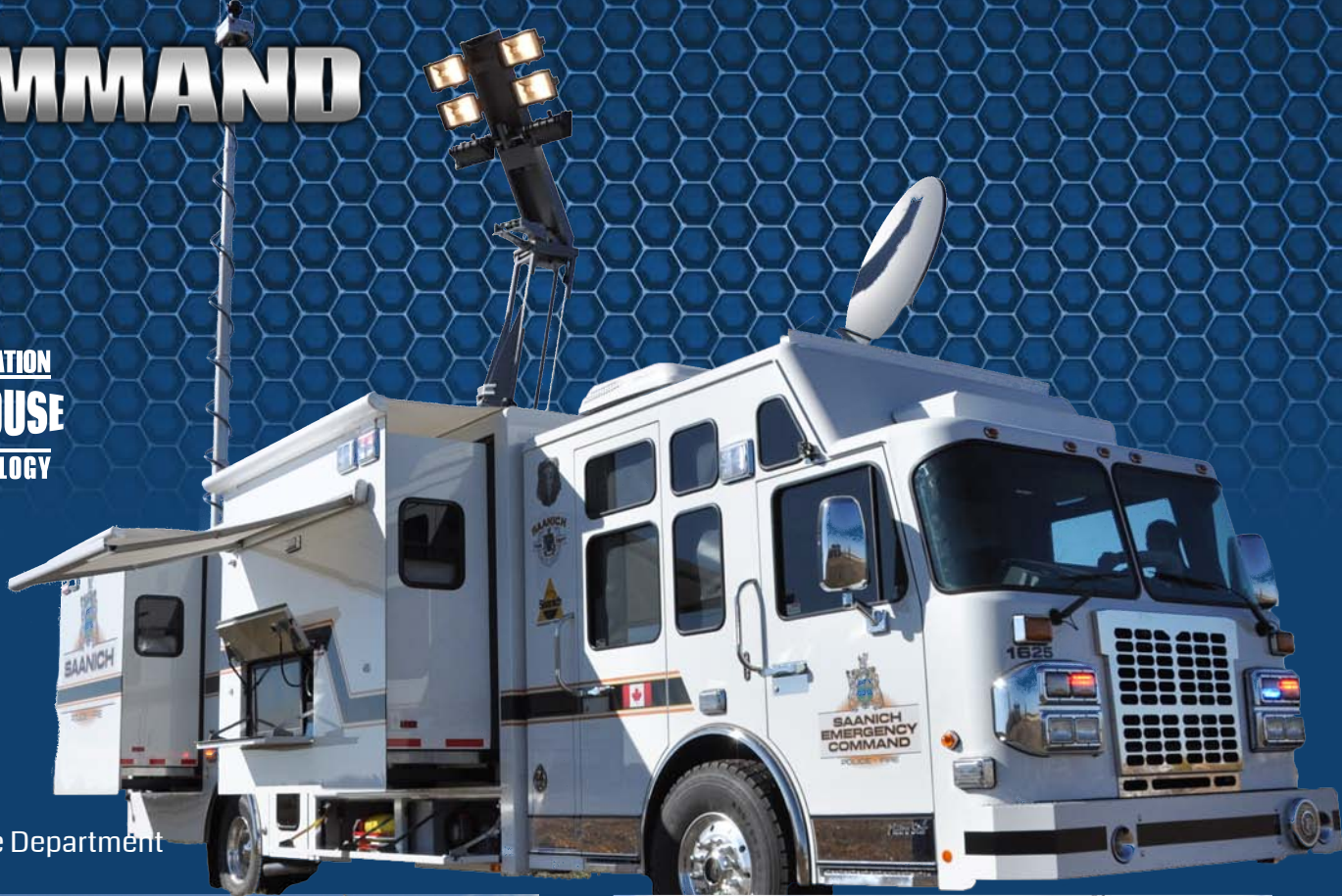
Saanich, BC Fire Department